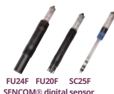
FU24F FU20F SC25F SENCOM® digital sensor