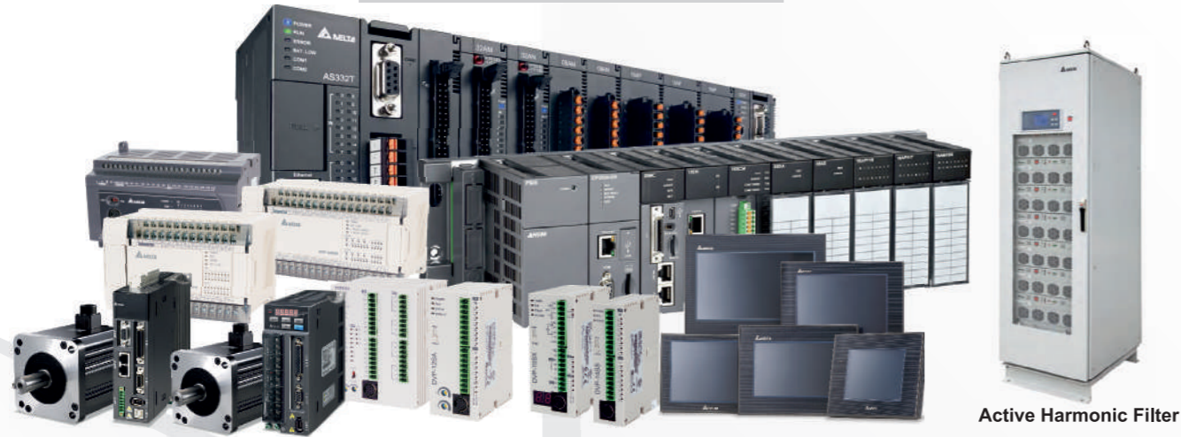
Active Harmonic Filter